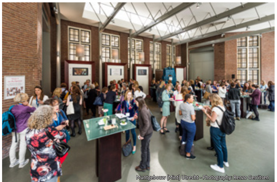
Muntgebouw (Mint) Utrecht

Interested in the possibilities in the region of Utrecht? More information can be found at www.utrechtconventionbureau.com . Or acquire more information personally at the Holland stand (F30) during IBTM World 2018.