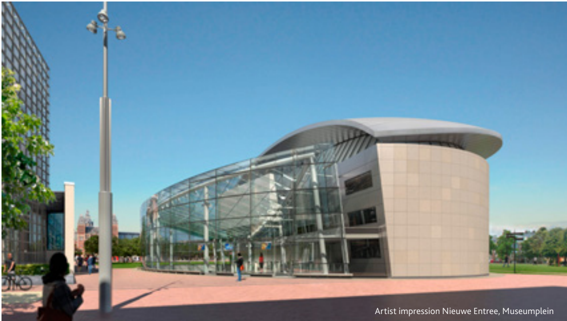
Artist impression Nieuwe Entree, Museumplein