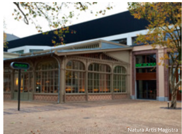
Natura Artis Magistra

In the summer of this year, the Van Gogh Museum finalizes a thorough renovation. The main entrance is moved to the Museumplein. The new entrance consists of a transparent building with technically advanced glass constructions, designed by Kisho Kurokawa Architect and Associates. The new entrance offers 800 square meters of additional surface,