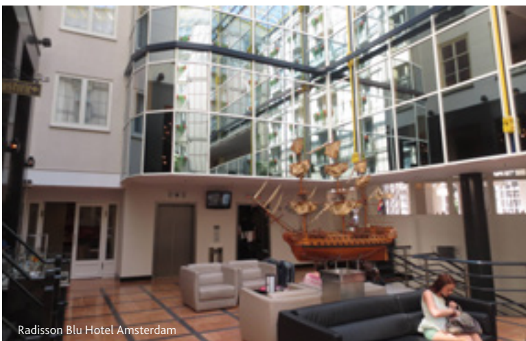
Radisson Blu Hotel Amsterdam

For more information regarding the Cvent Supplier Network, visit www.cvent.com/rfp/hotels .