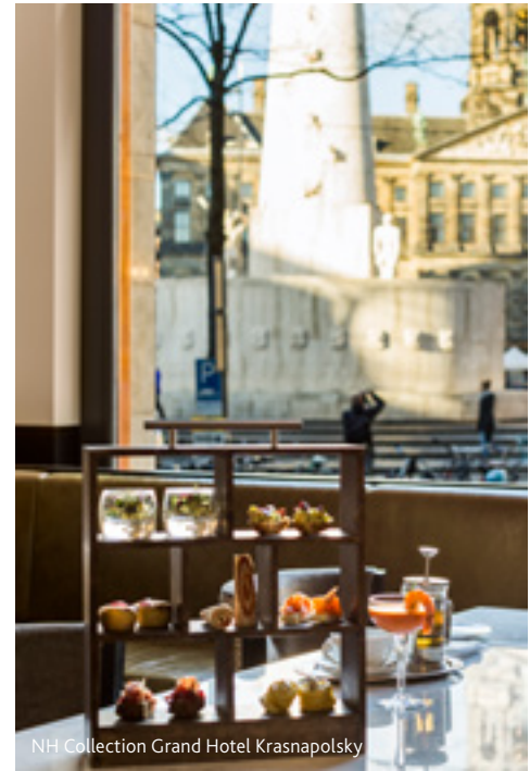
NH Collection Grand Hotel Krasnapolsky