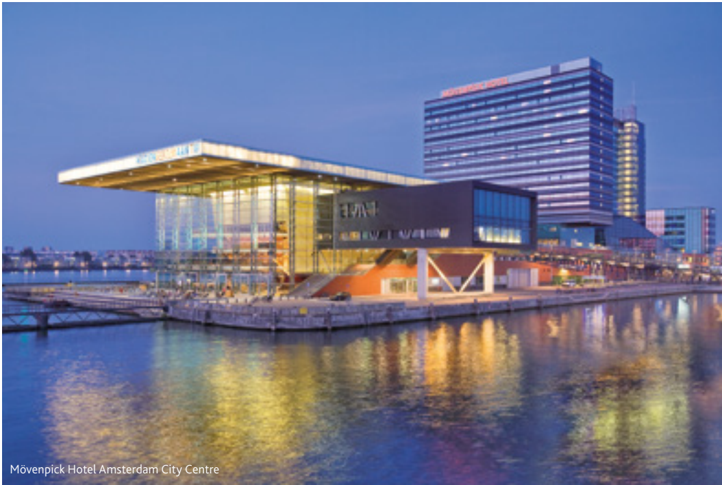
Mövenpick Hotel Amsterdam City Centre