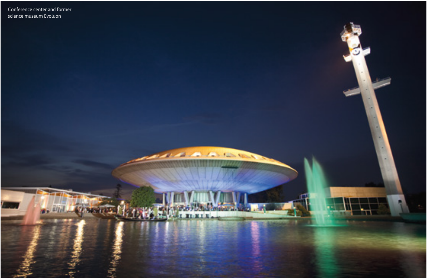
Conference center and former science museum Evoluon